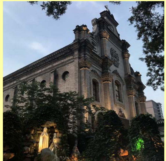
In 1605 the Wanli Emperor first granted land to Jesuit Father Matteo Ricci for the construction of a church. South Cathedral sits just across from that site.

Our final stop takes us to Beijing , China's capital, where ancient imperial sites and churches on land granted by emperors in centuries past coexist in one of the most dynamic cities in the world. The greater Beijing metropolitan area, taking in some 25 million people, is a place where the possibilities and challenges of modern urban life confront the Chinese Church and Chinese society alike.